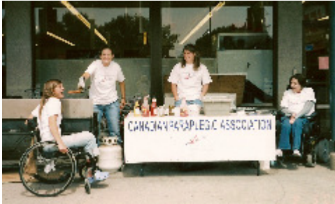
IGA BBQ 2006

We are also in need of volunteers for the day of the BBQ. Please contact Eliza for details at: 327-7577 or email eliza.walters@cpa-ab.org